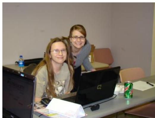
A couple of our amazing walk volunteers pose for the camera during a committee meeting.