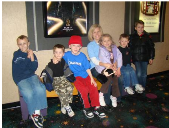
A group poses after attending one of the Autism Society Sensory Friendly movies in Omaha.